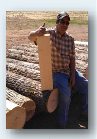
LdF elder collecting Basswood

The two main NRCS Conservation Programs that support these activities are EQIP (Environmental Quality Incentives Program) and CSP (Conservation Stewardship Program). EQIP is tailored to cost -share on conservation practices to meet resource concerns, while CSP looks at existing steward-ship activities and takes it to the next level by means of enhancements required for compliance. Both programs are an integral part of Lac Du Flambeau's forest and farm management, and have proven to be very successful. The WTCAC staff and Board of Directors works with all of the Tribes in Wisconsin to offer these programs through NRCS.