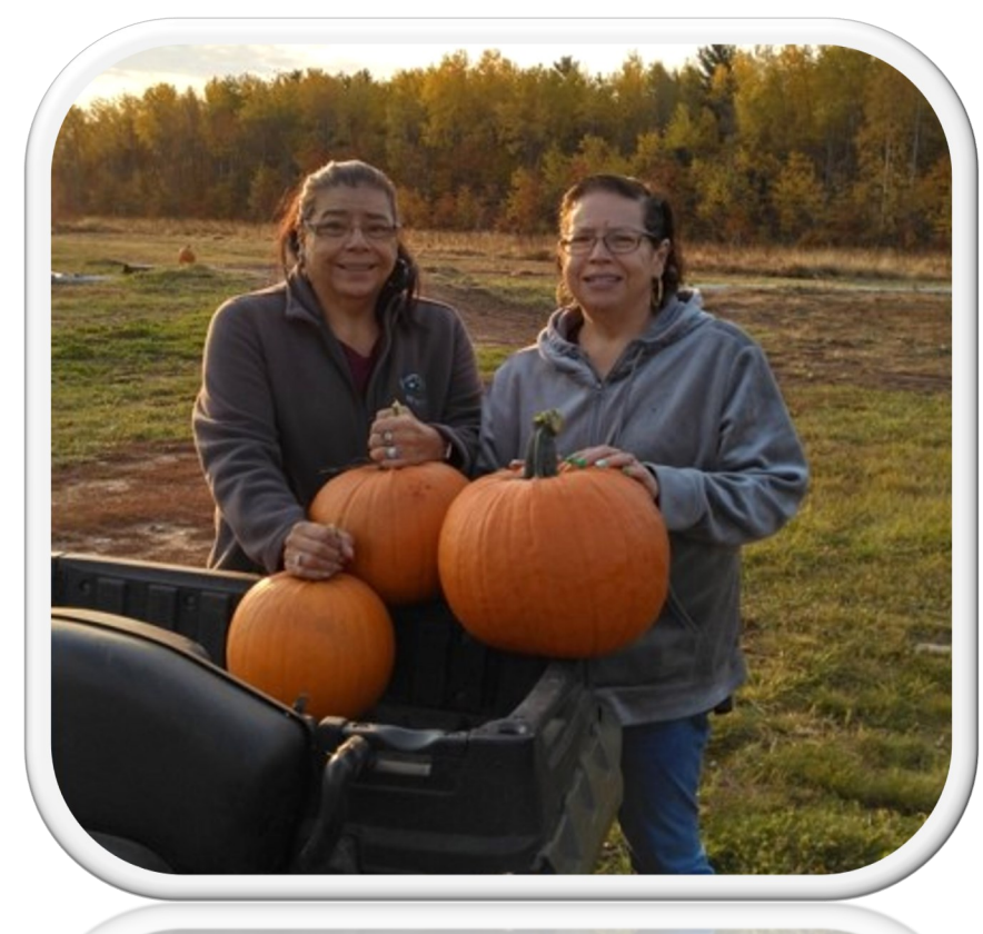
Lac du Flambeau community members harvesting pumpkins