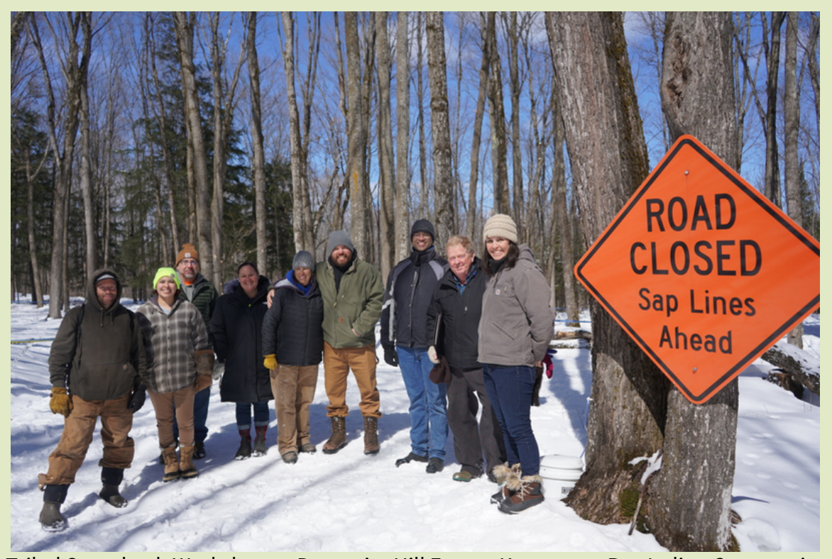
Tribal Sugarbush Workshop at Dynamite Hill Farms, Keweenaw Bay Indian Community

Going a step beyond better roads and trails to support are monitoring the trees in their stands to see if there are differences in health between tubed and non-tubed trees over time. At this time, there are no existing CPS scenarios under which the NRCS can cost-share for vacuum tubing systems for collecting maple sap. However, there can be clear benefits to soil health and plant health from reducing vehicle traffic for sap collection in the forest that comes with utilizing such a system. And while it will take a few years to get the ball rolling on developing an EQIP practice standard and cost-sharing for implementing tubing systems for collecting maple sap, efforts are underway to explore this option. If a time comes in the future where the NRCS can support sugarbush operations by helping pay for vacuum tube lines, don't be surprised when signs like these become a common sight in the forests.