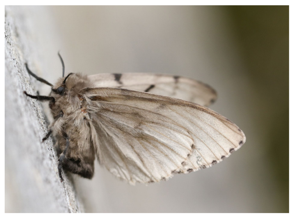
Spongy Moth

The Spongy moth has been recently gaining the attention of the media due to its former name. If the "spongy moth" is an unknown name, it is because this insect was previously known as the "gypsy moth". The reason for the name change is due to the word "gypsy" being considered a derogatory term for people of Romani descent. In 2021 the Entomological Society of America's Better Common Names Project reviewed any names that included or could include any derogatory and inappropriate terms with the specie's common name. The name "spongy moth" comes from the egg mass of the insect due to its soft and spongy consistency. Aside from the Name change the spongy moth has been an invasive pest of Wisconsin for decades and can still be a serious defoliator of many hardwood trees in yards and forested areas. These pests are very dynamic, and the population can explode under the right conditions and lead to extensive defoliation. The egg-laying process plays an important role in these dynamic as female spongy moths egg masses can have up to 1,000 eggs. These egg masses can be found on trees, stacked boards, piles of wood, and even vehicles. The removal or destruction of the egg masses could help reduce the local population. One method used for disposing of the egg masses is to scrap them into a container of soapy water and set them aside for a couple of days before discarding them into a garbage bin.